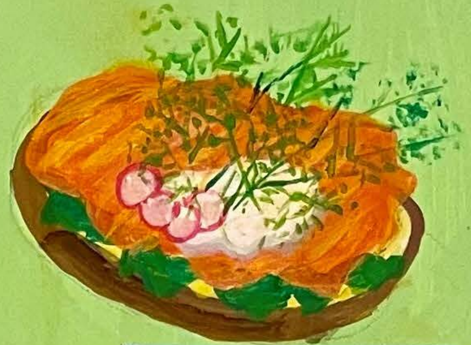
RØGET LAKS KR 99 SMOKED SALMON