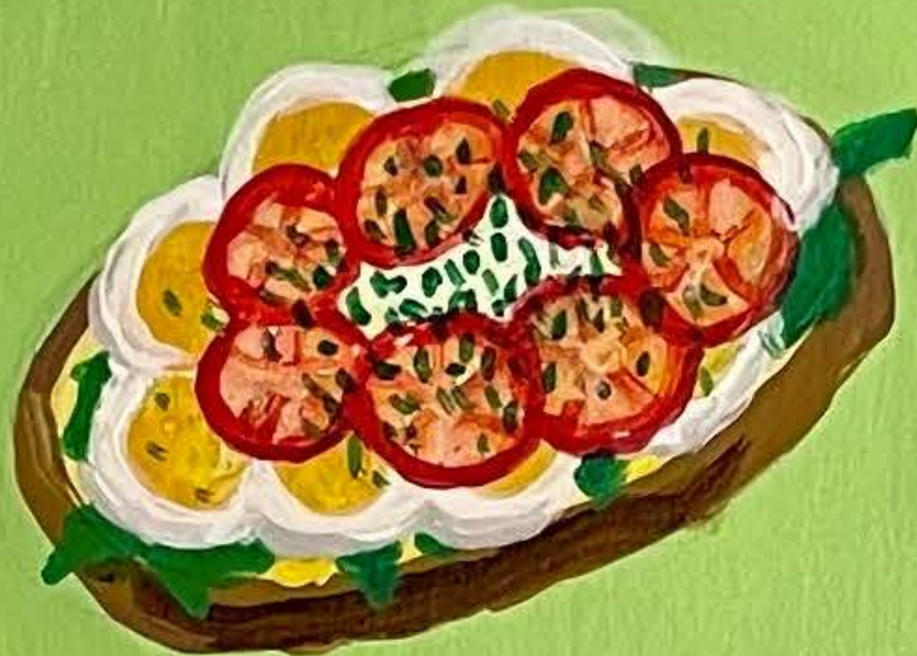
ÆG & TOMAT KR 79 EGG & TOMATO