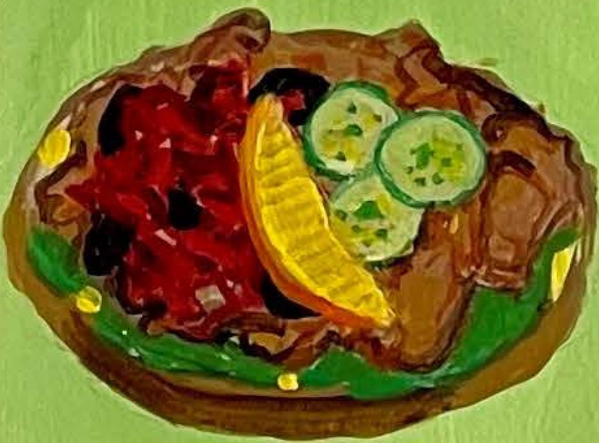
ANDECONFIT KR 99 DUCK CONFIT