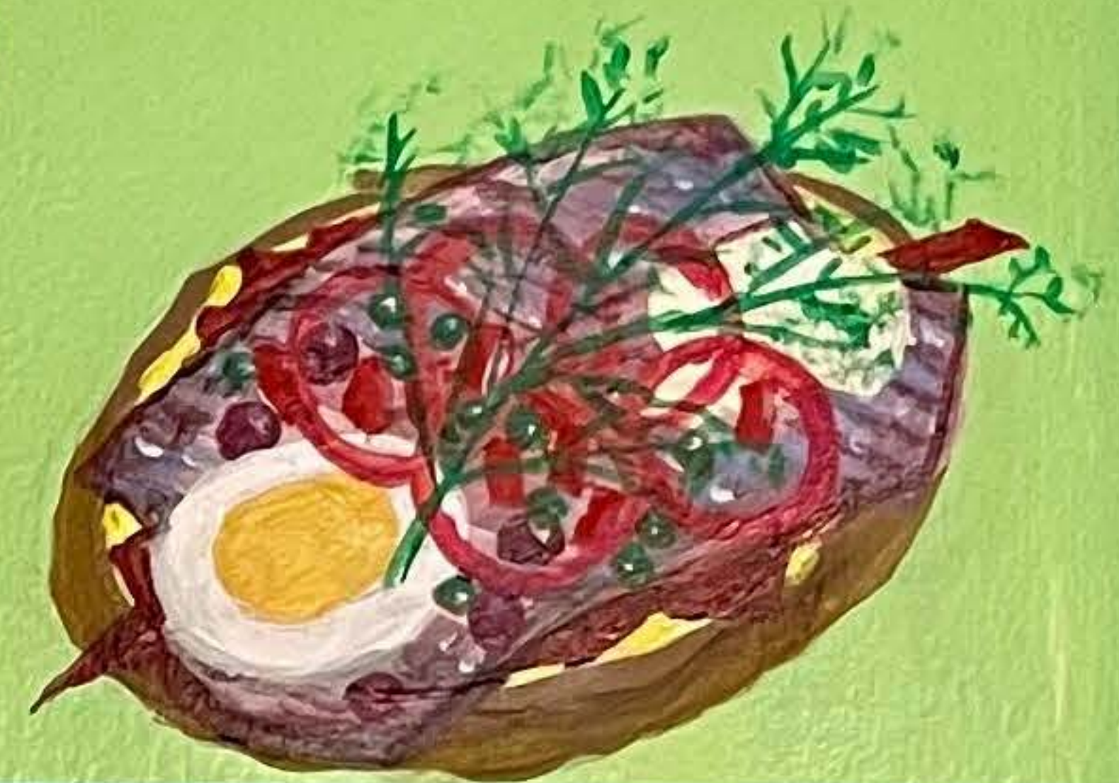
CHRISTIANSØ SOLBÆR SILD KR 99 HEERING FROM CHRISTIANSØ