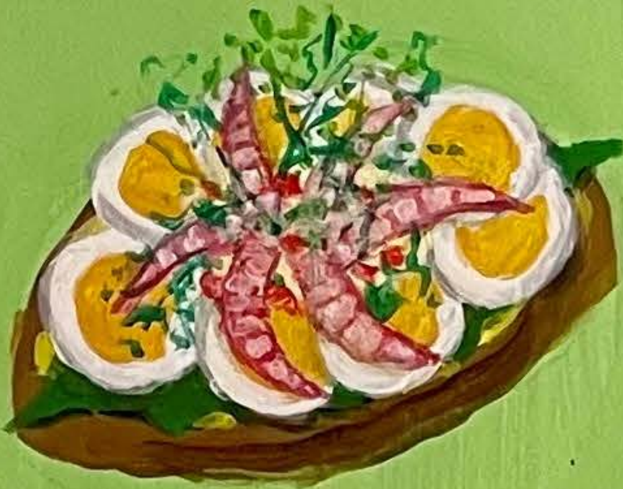
ÆG & REJER KR 98 EGG & SHRIMPS