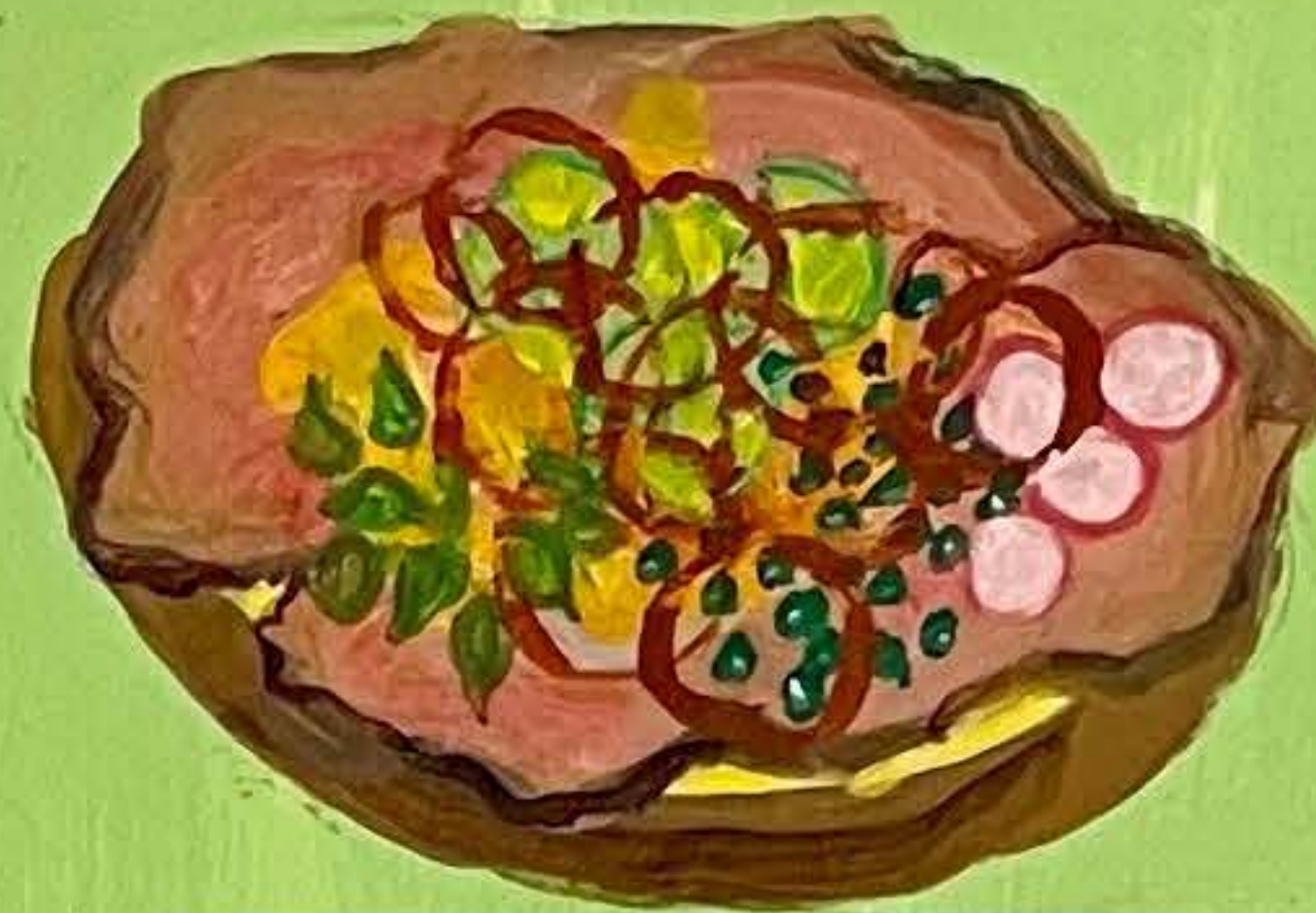
ROASTBEEF KR 95 ROAST BEEF