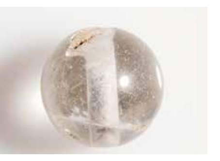
KØM 01699 x1060 Rock-crystal bead, almost spherical. Length 11.9 mm, diameter 12.3 mm.

Stray find, no information about find spot.