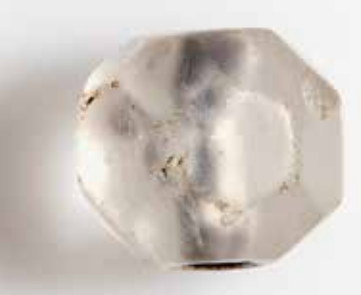
Table 2 - Rock crystal Beads